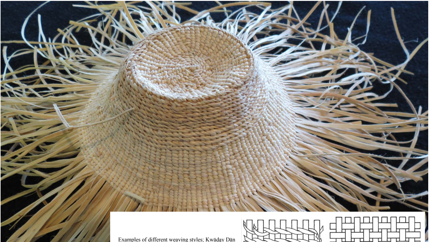
Examples of different weaving styles; Kwädäy Dän Ts'inchj's hat was made using the twining method (images created by and used with permission of Kathryn Bernick).